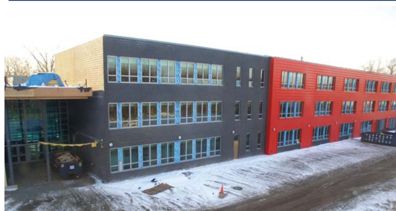
University High School of Science and Engineering Hartford, CT

Diggs Construction partners with its clients by providing professional construction services that form a relationship built on trust and teamwork, which results in successful projects.